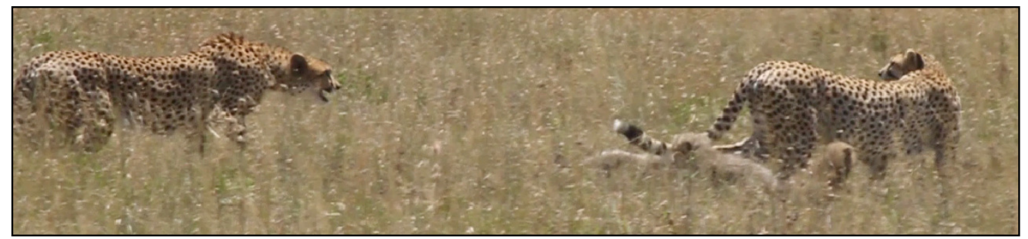
After a while he recognised that he wasn't going to get anywhere with Almond and he let them all wander off. The little family then went off and found a kopjes to spend the rest of the afternoon lounging around on, with one of the cubs even accidentally going swimming in a puddle!